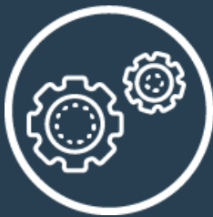
BUSINESS IT ALIGNMENT