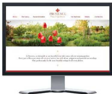
Provence Venue & Guesthouse