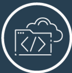
WEB DEVELOPMENT & HOSTING