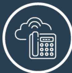
VOIP & CLOUD PBX SOLUTIONS