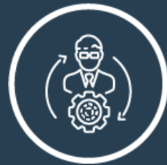
MANAGED IT SOLUTION