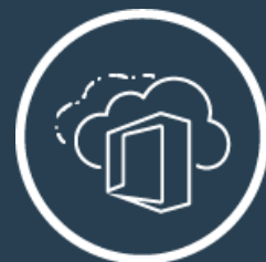
MICROSOFT 365 BUSINESS SOLUTIONS